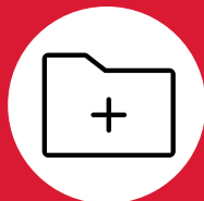
Information Systems & Management