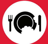
Poverty & Health