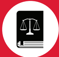
Law, Ethics & Human Rights