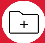
Information Systems & Management